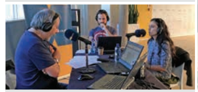
Cape Talk Outside Broadcast