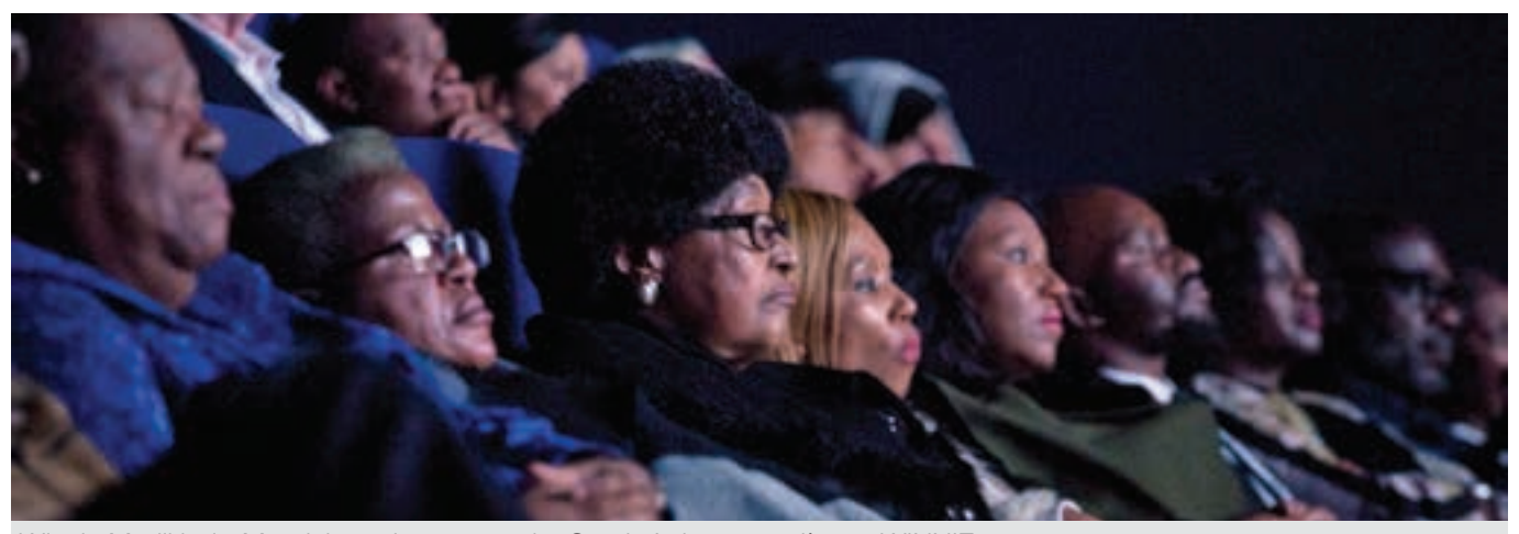
Winnie Madikizela-Mandela and guests at the South African première of WINNIE

The choice of Opening Night film set a decidedly political, challenging tone for a final selection of 73 films selected from 522 submissions, all of which reflected and refracted the current state of our world. Encounters presented 20 World Premières, 45 South African Premières and 1 International Première from a line up comprising 32 South African and 41 International features and shorts. The film programme grew substantially in 2017 with a 28% increase from the previous year (57/73) and an increase of screenings to 147 across both cities.